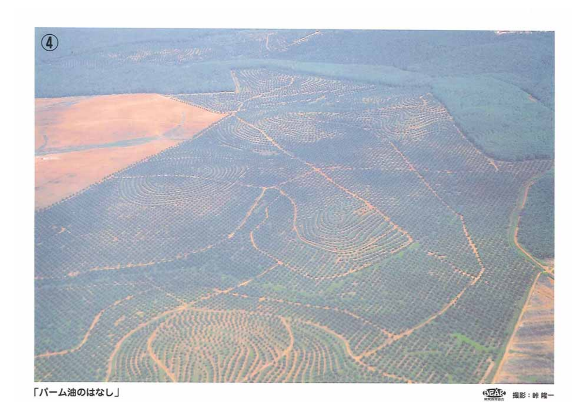
C ESDRC & DEAR Photo by Ryuichi TOGE