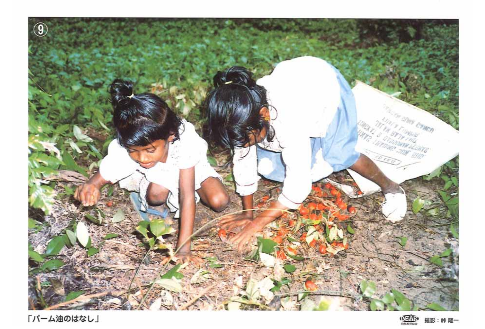
C ESDRC & DEAR Photo by Ryuichi TOGE